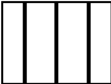
CROSS ROOM DITCHING

To make carpet removal and debris clean-up easier, checkerboard ditching is very helpful. Using as wide of a self-scoring blade as possible, make ditches 1.25-1.75 m crossways from the way the machine will be removing the goods. Running the machine crossways from the ditches will make smaller pieces of debris to be hauled away. Instead of large gummy rolls of carpet, there are small squares that can be rolled, palletized, put on a dolly, or folded with the sticky side in.