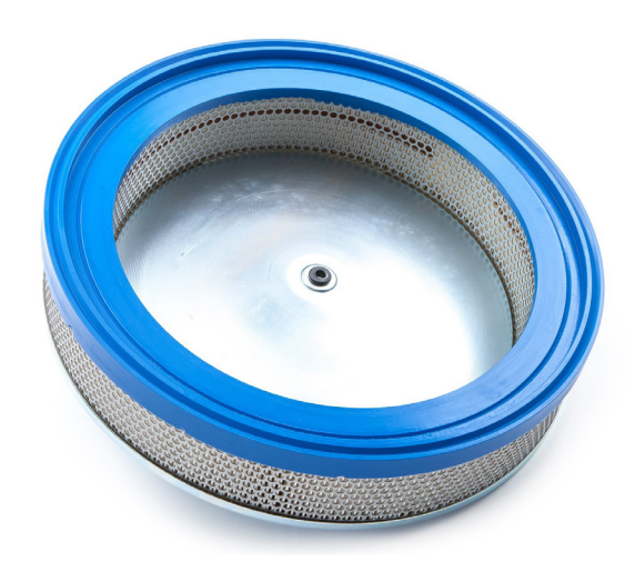
402472 - Filter, HEPA (Only Spare Parts)