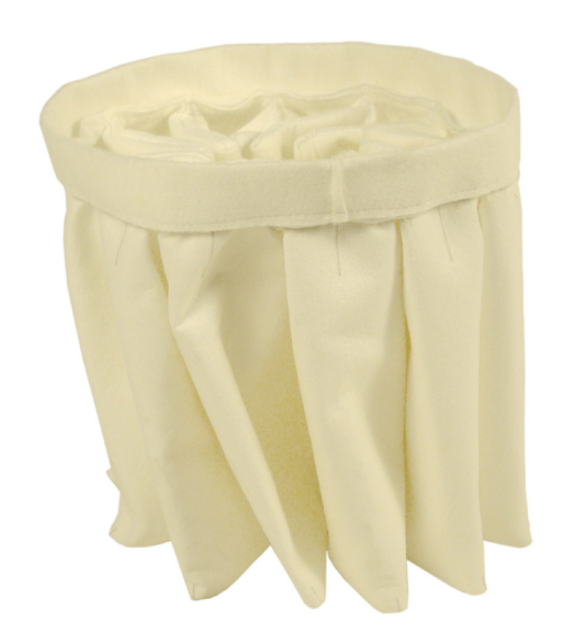
402469- Filter, Primary (Only replacement filter)